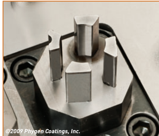
©2009 Phygen Coatings, Inc.

For more information, contact Phygen, Inc. 1400 Marshall St., NE, Minneapolis, MN 55413 Phone: 888-749-4361 / Fax: 612-331-4230 www.phygen.com / email:tech@phygen.com